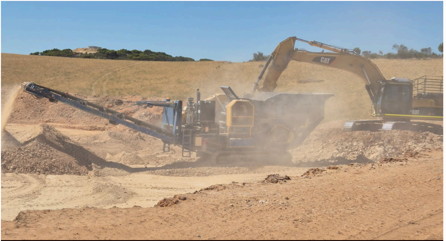
CRUSHING AT BURNS ROAD