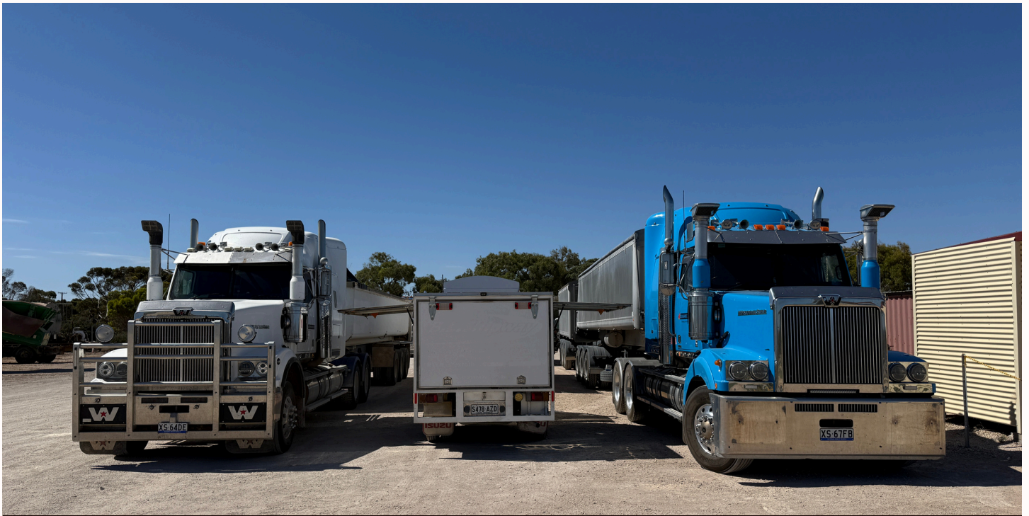
PRIME MOVERS SERVICING