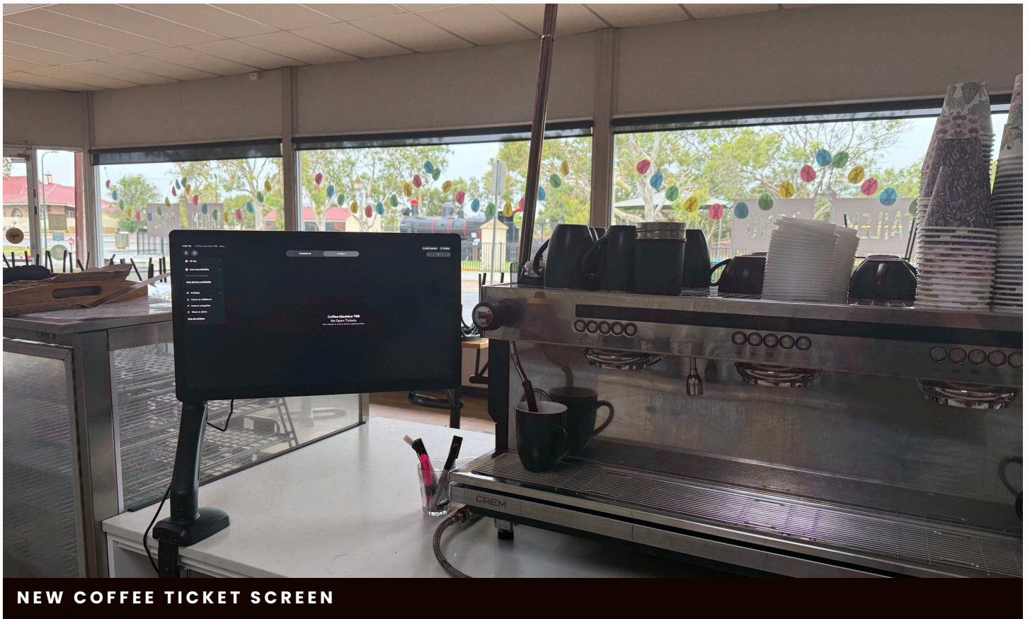
NEW COFFEE TICKET SCREEN