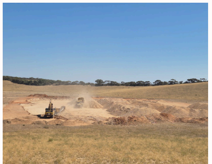
CRUSHING AT BURNS ROAD

It's been a great start to the year, and we're looking forward to keeping things rolling with more projects across the region.