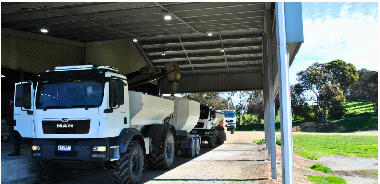
SPREADERS BEING LOADED

It's been a productive start to the year, and the team is looking forward to keeping operations running smoothly and safely as the season progresses.