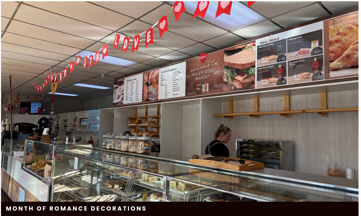
MONTH OF ROMANCE DECORATIONS