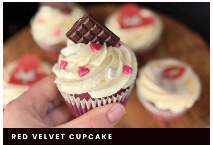
RED VELVET CUPCAKE

As one theme ends, another begins. Keep an eye out next month... there may be some spiced favourites hopping into the cabinets soon.