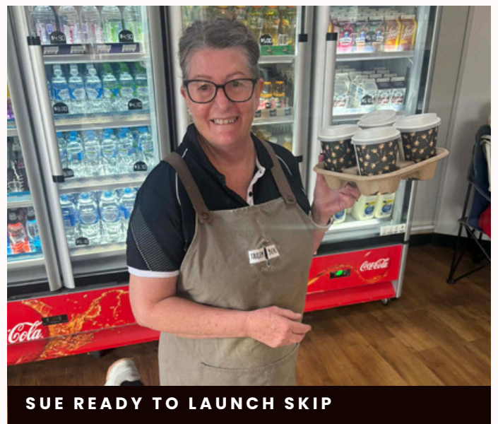
SUE READY TO LAUNCH SKIP

We look forward to continuing to expand and improve our services, making every visit to the bakery as convenient and enjoyable as possible.