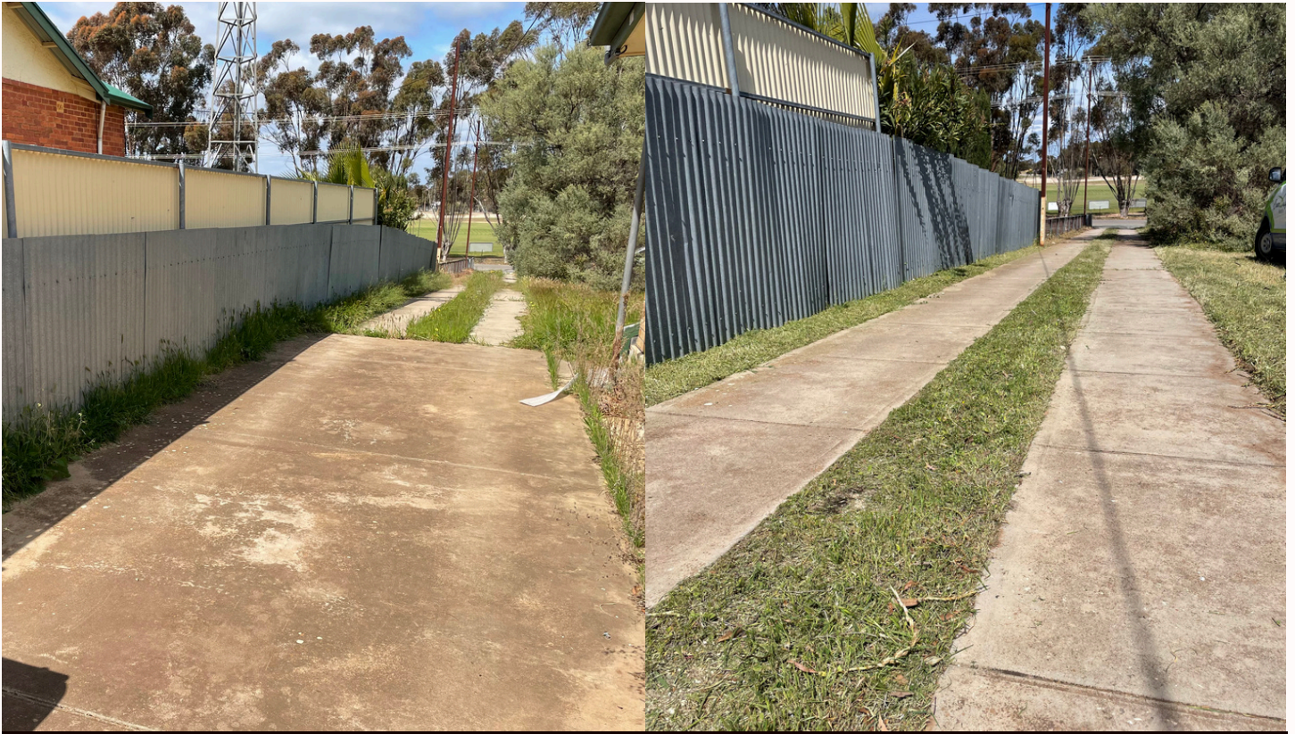
BEFORE AND AFTER A RECENT GARDENING JOB