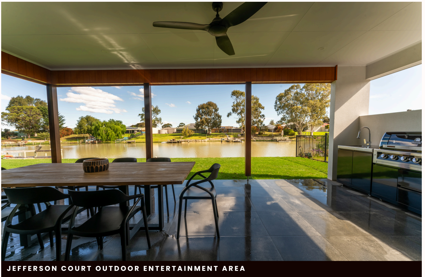
JEFFERSON COURT OUTDOOR ENTERTAINMENT AREA